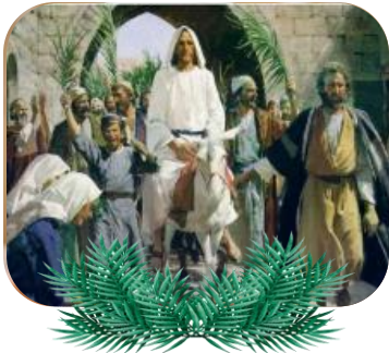
Palm Sunday/ Passion Sunday