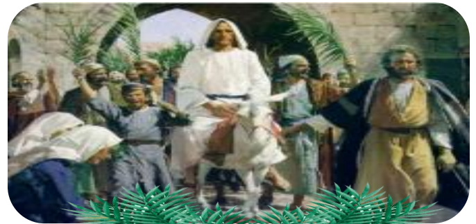
Palm Sunday/ Passion Sunday

“HOSANNA TO THE SON OF DAVID” and “BLESSED IS HE WHO COMES IN THE NAME OF THE LORD”