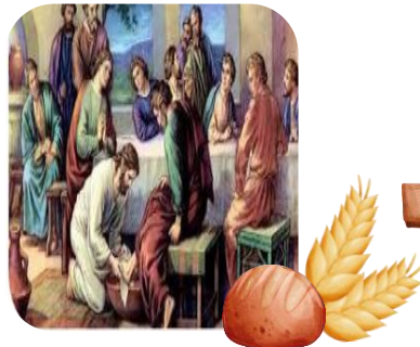
Maundy Thursday / Holy Thursday