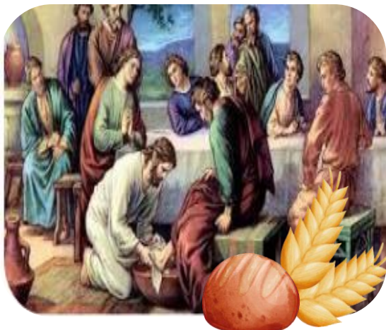
Maundy Thursday / Holy

Maundy Thursday is also known as Holy Thursday